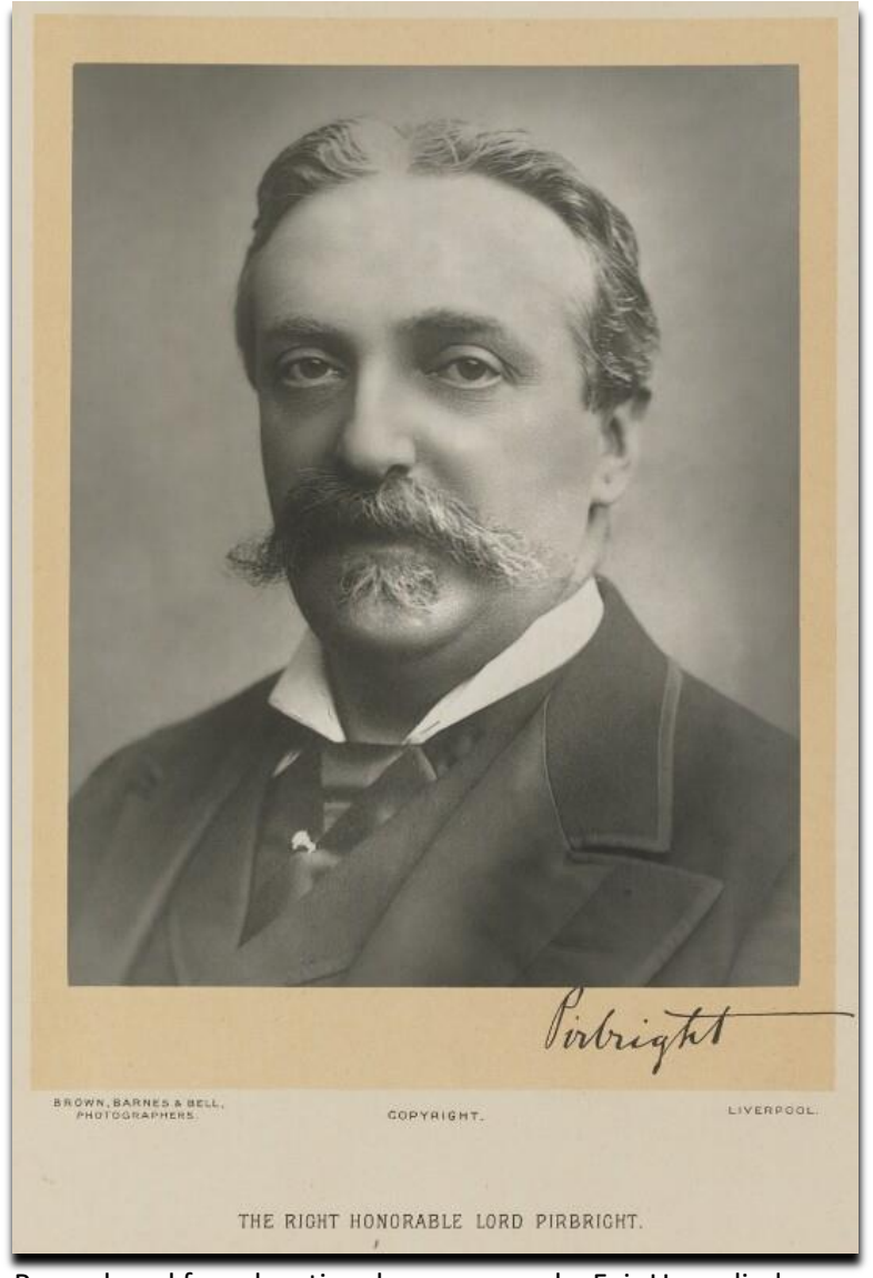
Reproduced for educational purposes only. Fair Use relied upon.